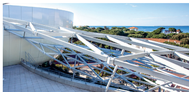
Antipolis Convention Centre - Antibes

A Workshop on Tobacco Harm Reduction, opened to the official delegates of CORESTA Member Organisations, is also being held as part of this event. This initiative is part of the CORESTA Board's strategy regarding the shaping of CORESTA's future and developing its role in tobacco harm reduction.