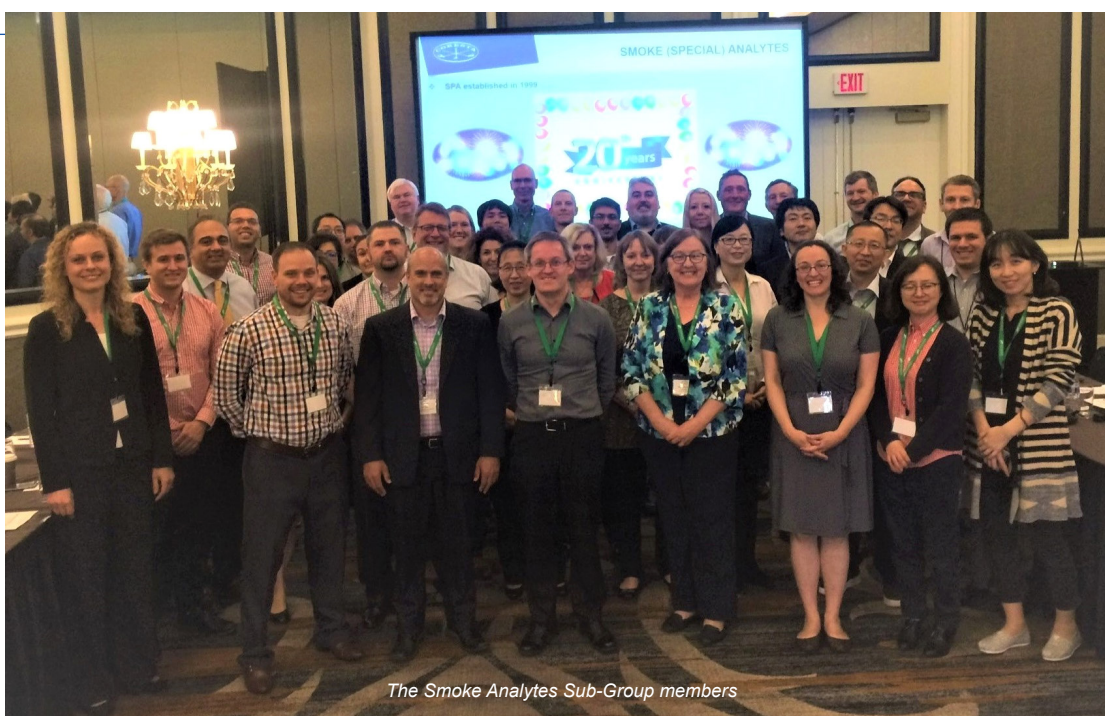
The Smoke Analytes Sub-Group members