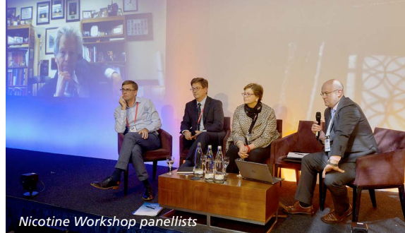
Nicotine Workshop panellists

Toxicant Ceilings: On the Smoke-Techno side one of the hot topics is toxicity of products. The proposals by the WHO TobReg study group to introduce ceilings for the nicotine-corrected levels of selected toxicants in cigarette emissions were presented. The workshop participants agreed that the methods and tests to fix those ceilings need to be backed and validated by robust science and their impact on farmers and suppliers requires close examination.