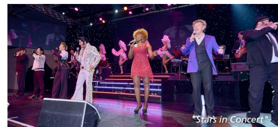
"Stars in Concert"