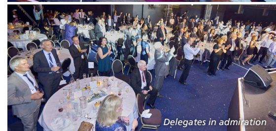
Delegates in admiration