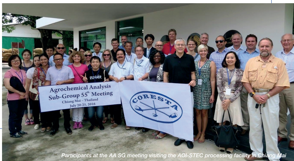
Participants at the AA SG meeting visiting the AOI-STEC processing facility in Chiang Mai

The next Agrochemical Analysis Sub-Group meeting will be held in September 2017 in a location still to be confirmed.