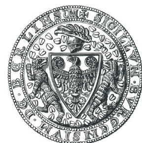
Guild Seal of Berlin, 1280

More information on Berlin may be found at www.visitberlin.de .