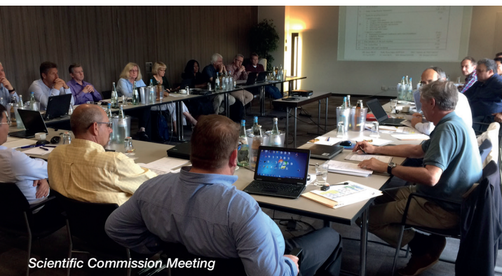
Scientific Commission Meeting